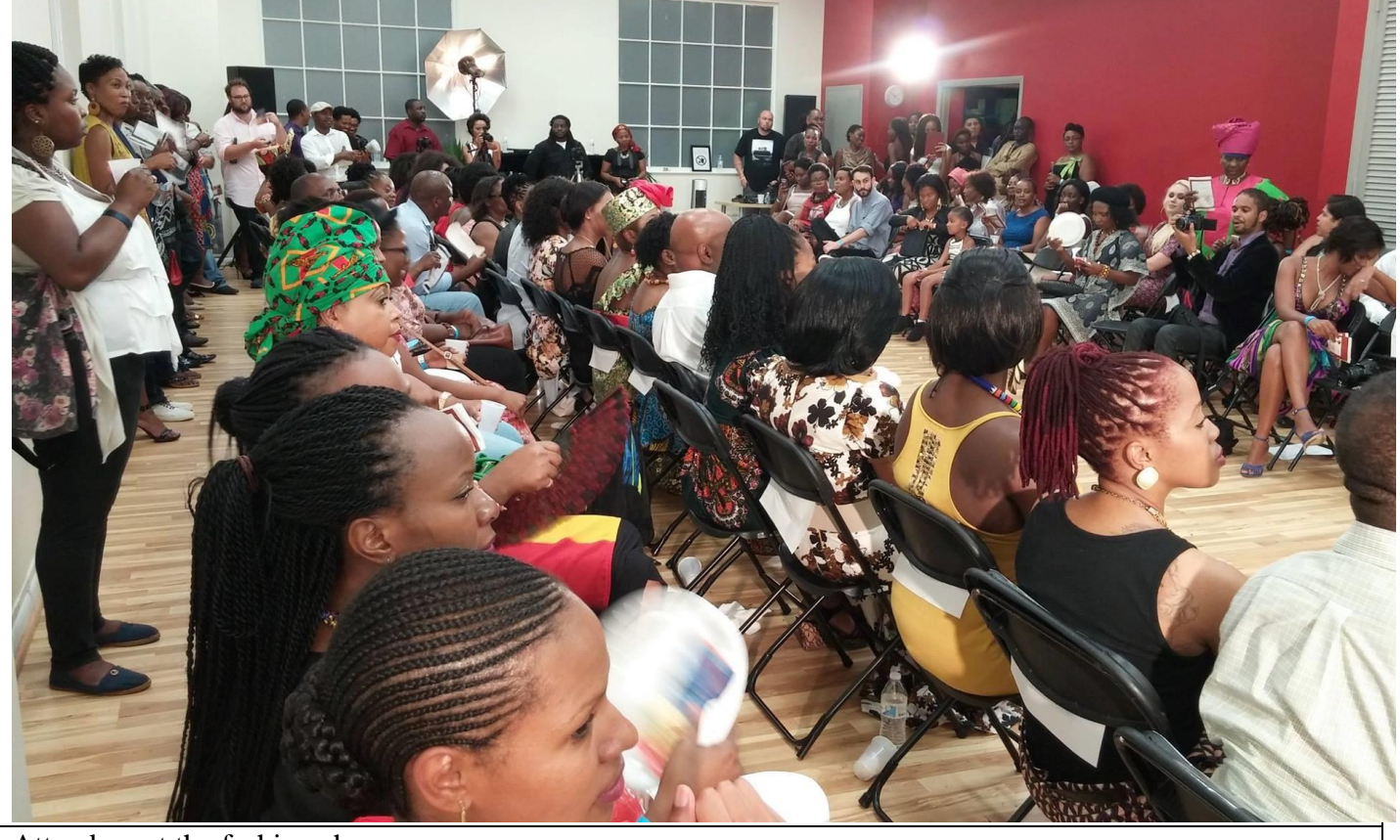
Attendees at the fashion show