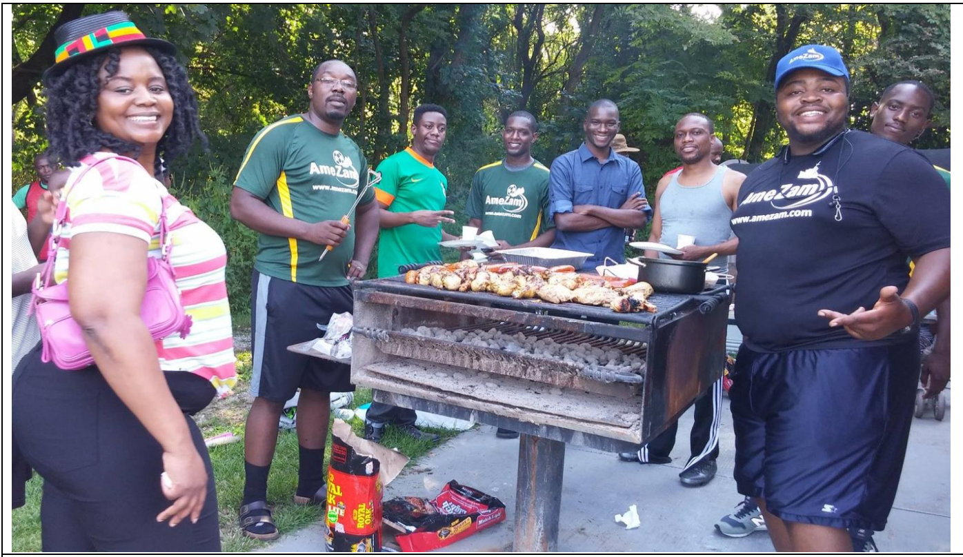
The Zambian soccer team and their supporters grill meat after a long game.