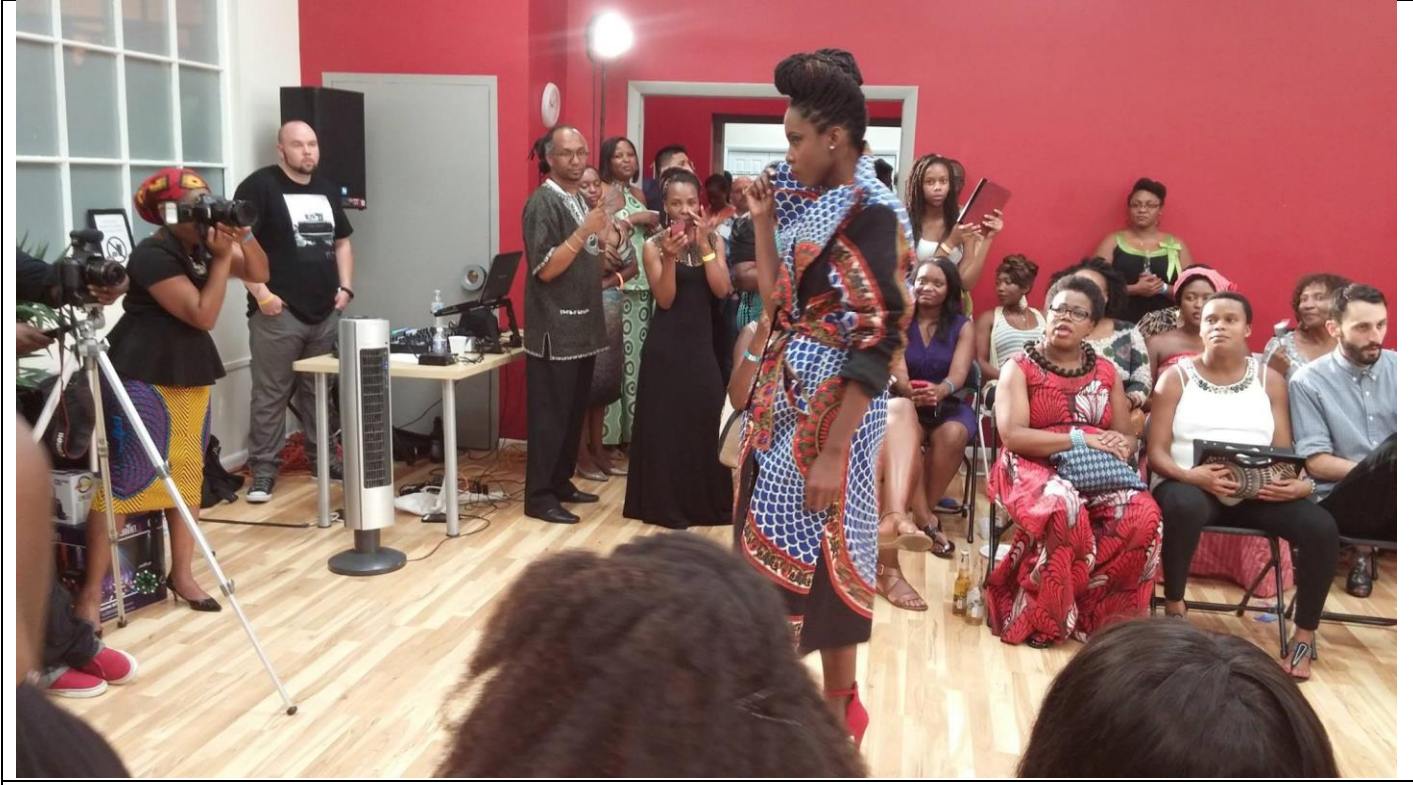
One of the models show off a design by one of the talented designers.