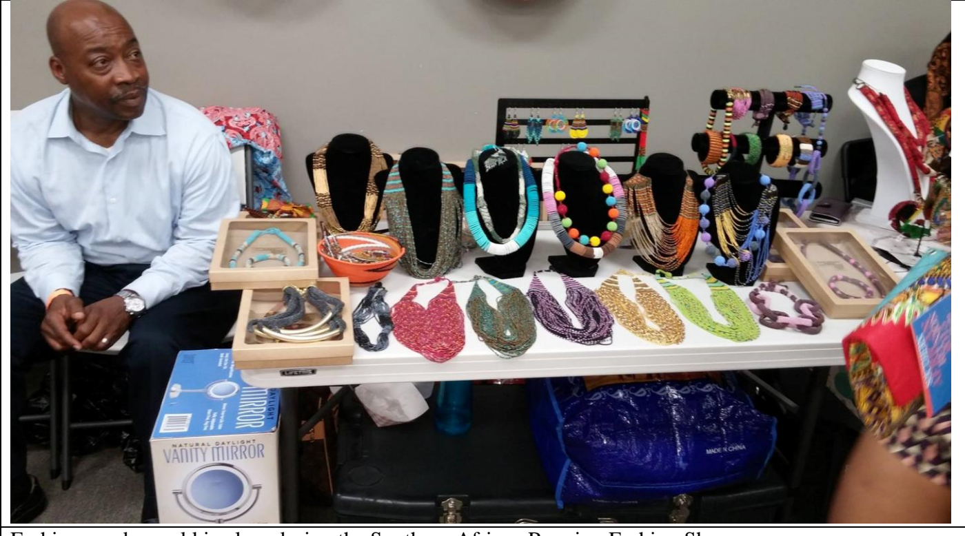
Fashion vendors sold jewlery during the Southern African Reunion Fashion Show